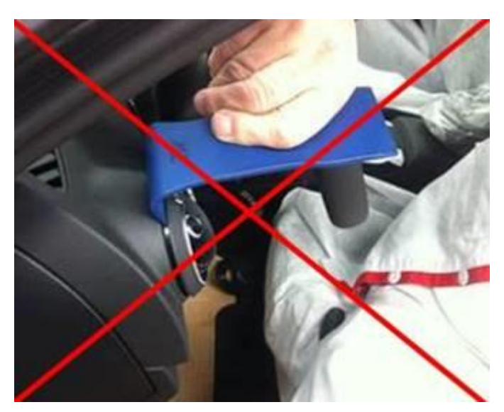
Figure 1. Incorrect removal method for the instrument panel vent.

If the instrument panel vent is removed by prying from the adjustment ring the outlet mechanics are permanently damaged. The ring is dislodged from the detents and adjustment is no longer possible (Figure 1).