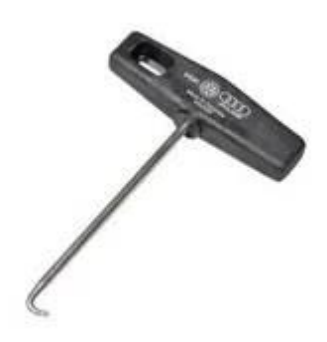
Figure 3. 3438 T-Handle Hook

2. Alternative tool for instrument panel vent removal (Figure 3).