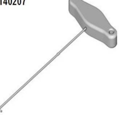
Figure 2. T40207 Hook tool

2. Alternative tool for instrument panel vent removal (Figure 3).