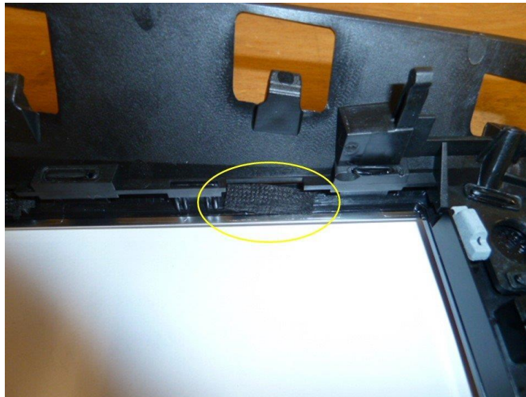
Figure 2. Close-up of Figure 1.