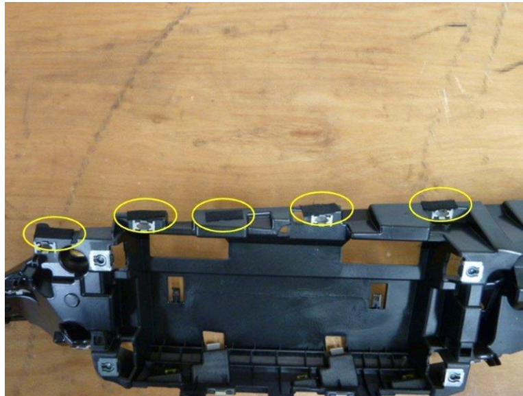
Figure 3. Apply felt strips to the circled areas.