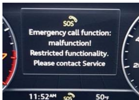
Figure 1. The warning message is shown in the instrument cluster.