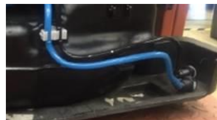
Figure 1. Lines in the tank.

Make sure there is now sufficient spacing between the fuel lines.