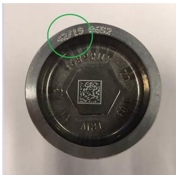
Figure 3. Example of production date after week 36/19.