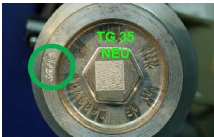
Figure 2. Example of initial production date of week 36/19.

Make sure that the new parts you are installing have production date week 36/19 or later (Figure 1 and 2, green circles).