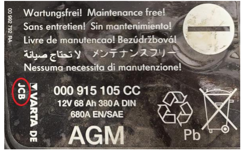
Figure 2: Example of the manufacturer/vendor code on the battery label.

Figure 1: Example of battery information in the test plan, also showing the serial number auto-filled.