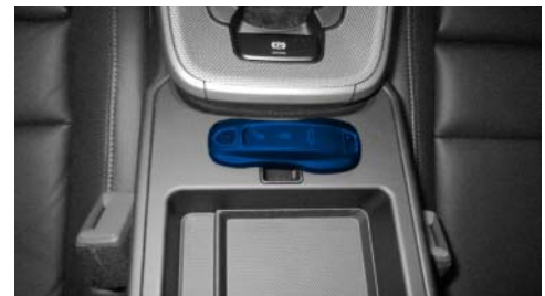
Emergency start tray

2 Place the driver's key with the back facing down in the area in front of the storage compartment under the armrest (emergency start tray) in order to guarantee a permanent radio link between the vehicle and driver's key ⇒ Emergency start tray .