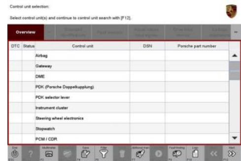
Control unit selection

5 Enter the campaign in the Warranty and Maintenance booklet.