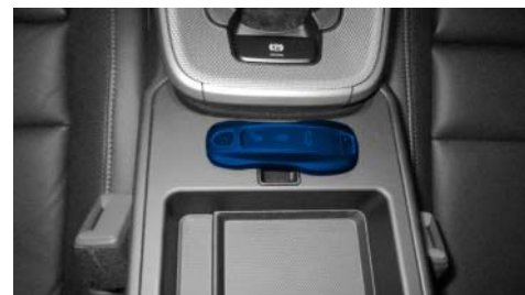
Emergency start tray

2 Place the driver's key with the back facing down in the area in front of the storage compartment under the armrest (emergency start tray) in order to guarantee a permanent radio link between the vehicle and driver's key ⇒ Emergency start tray .