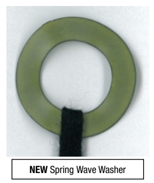
The 3 "tangs" seen on the inside of the OLD wave washer have been deleted. The new washer also has a goldish-color flurocarbon resin coating. The inside diameter of the NEW spring wave washer has been decreased and a small felt added to allow the washer to turn smoother with the buckle and have a better fit on the shoulder portion of the retaining bolt.