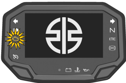
Z H2/Z H2 SE, NINJA ZX-10R/RR