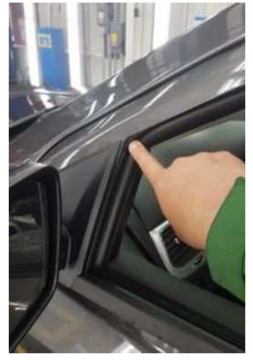
Fig. 2 Pushing On Molded Joint