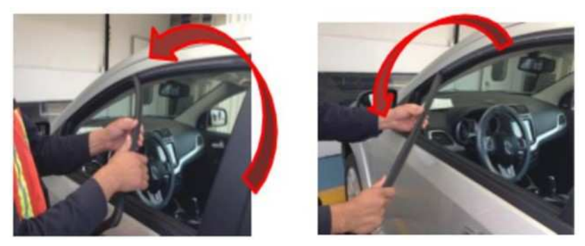
Fig. 4 Weatherstripping Removal

1. Using a trim stick or equivalent, replace the window weatherstripping on the door glass run channel (Fig. 4) .