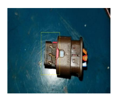
Fig 2, Example signs of corrosion

This document does not authorize warranty repairs. This communication documents a record of past experiences. STAR Online does not provide any conclusions about what is wrong with the vehicle. Rather, it captures all previous cases known that appear to be similar or related to the vehicle symptom / condition. You are the expert, and you are responsible for deciding on the appropriate course of action.