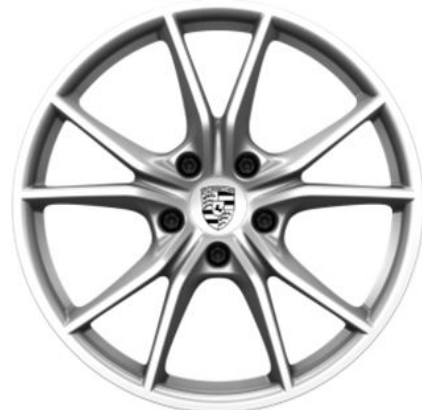
20-inch Carrera S 4

RA: 10J x 20 H2, RO 45 Part No. 982.601.025.J_FFF/ 982.601.026.B_FFF