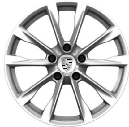
19-inch Boxster S 4

RA: 10J x 19, RO 45 Part No. 982.601.025.A_FFF