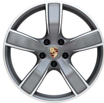
20-inch Carrera Sport

Part No. 982.601.029.AG_FFF/ 982.601.026.D_FFF