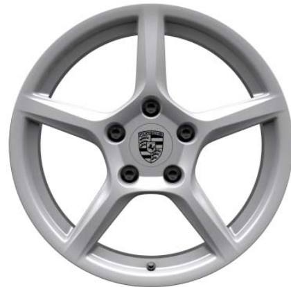
18-inch Boxster 4