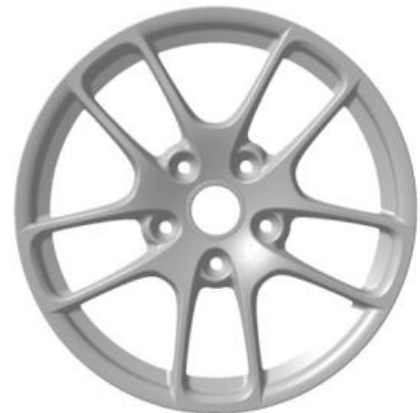
18-inch Cayman 3