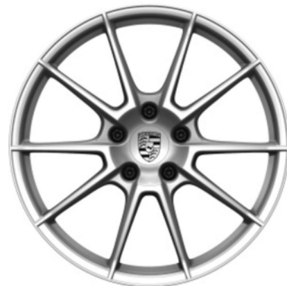
20-inch 982 GTS