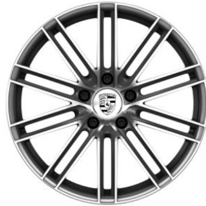
20-inch 911 Turbo 4