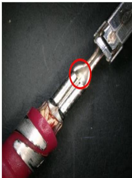
Figure 2. Improperly crimped wire.