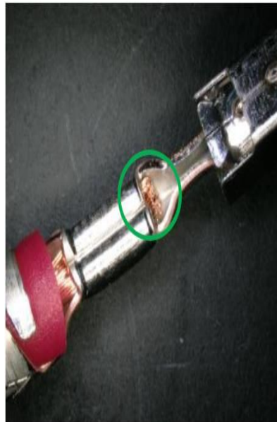
Figure 1. Properly crimped wire.