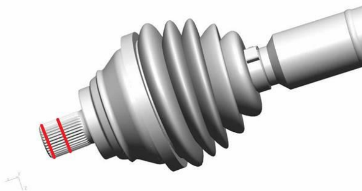
Figure 1. Apply locking fluid around the treaded connection.