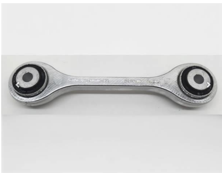
Figure 2. Coupling Rod.

Replace the affected coupling rod(s) of the front axle (Figure 2) according to ELSA at Repair Manual: Chassis >> Suspension, Wheels, Steering >> Front Suspension >> Front Axle >> Stabilizer Bar >> Coupling Rod, Removing And Installing.