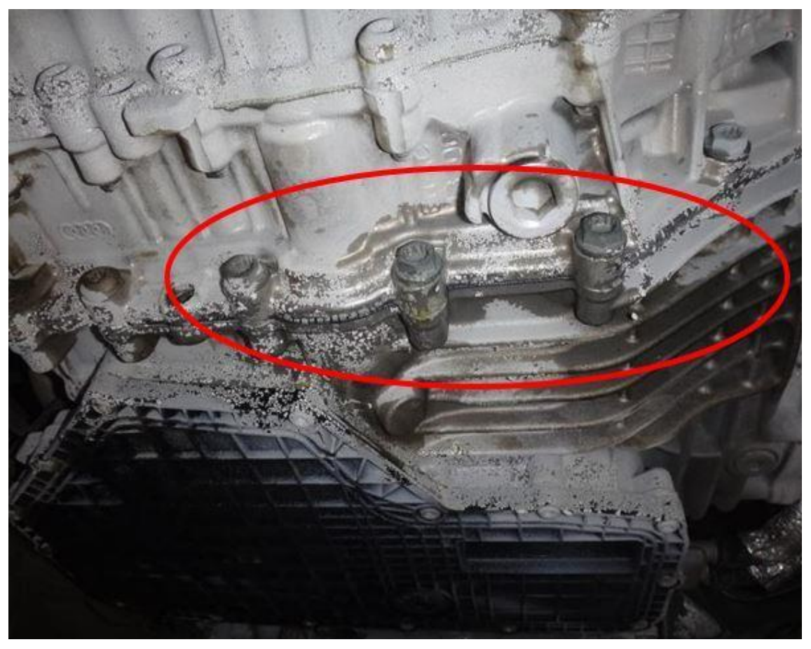
Figure 2. Oil leak example.