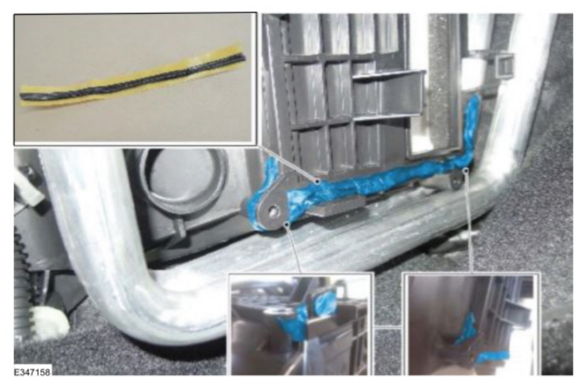
11. To install, reverse the removal procedure.

(2). Press the butyl sealing strip around front/rear corner and into the hole. (Figure 8)