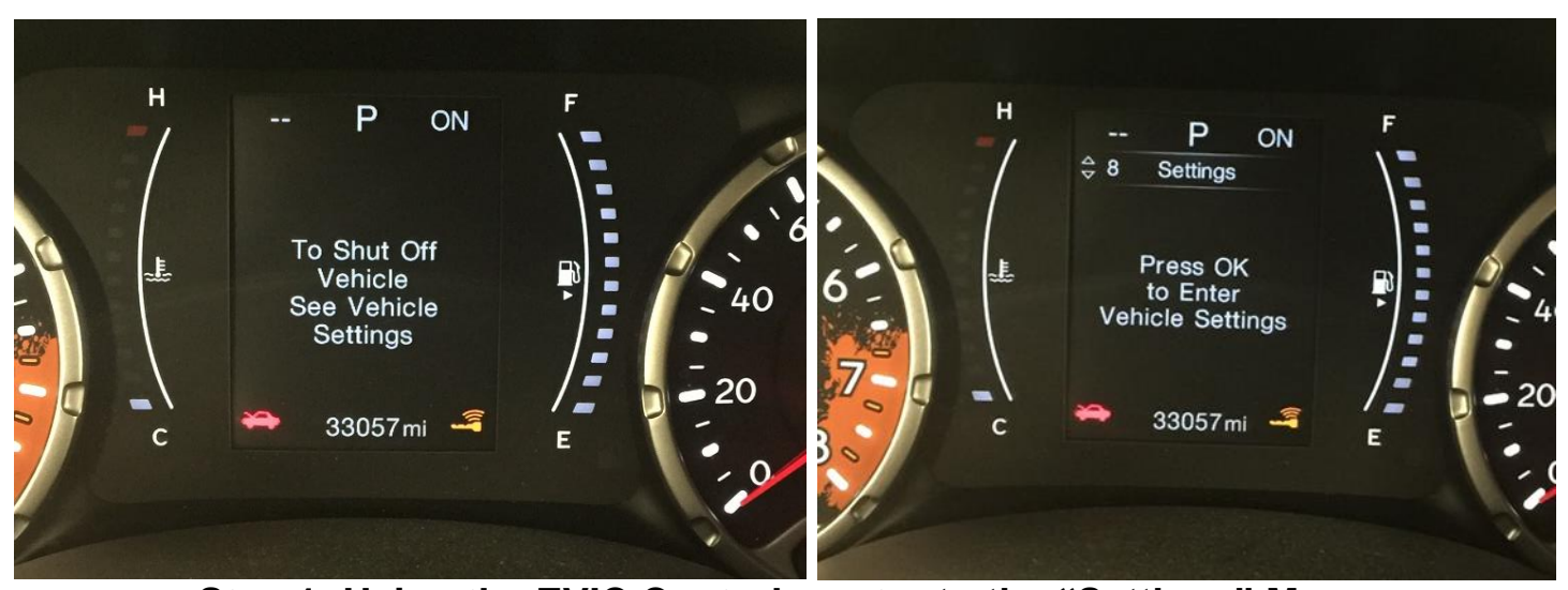
Step 1: Using the EVIC Controls, enter to the "Settings" Menu

Note: Ensure the vehicle is parked in a safe location which is accessible by a tow vehicle. The vehicle <u>WILL NOT RESTART</u> after performing this procedure unless the fault is cleared or the battery is disconnected