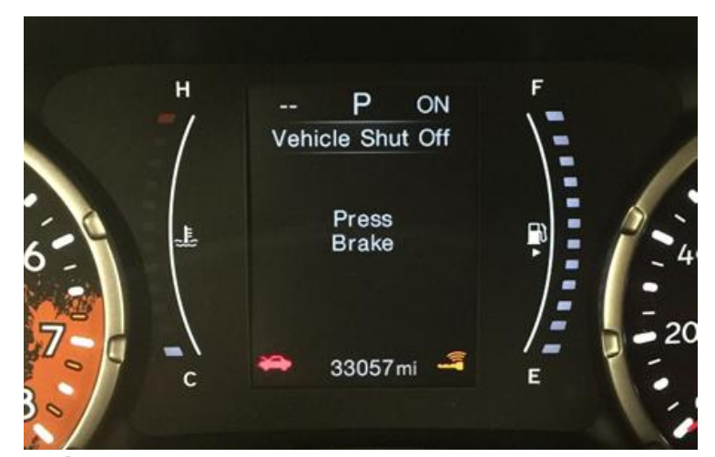
Step 4: Once the timer has completed and the "Press Brake" message is displayed. You must release the OK button.

This document does not authorize warranty repairs. This communication documents a record of past experiences. STAR Online does not provide any conclusions about what is wrong with the vehicle. Rather, it captures all previous cases known that appear to be similar or related to the vehicle symptom / condition. You are the expert, and you are responsible for deciding on the appropriate course of action.