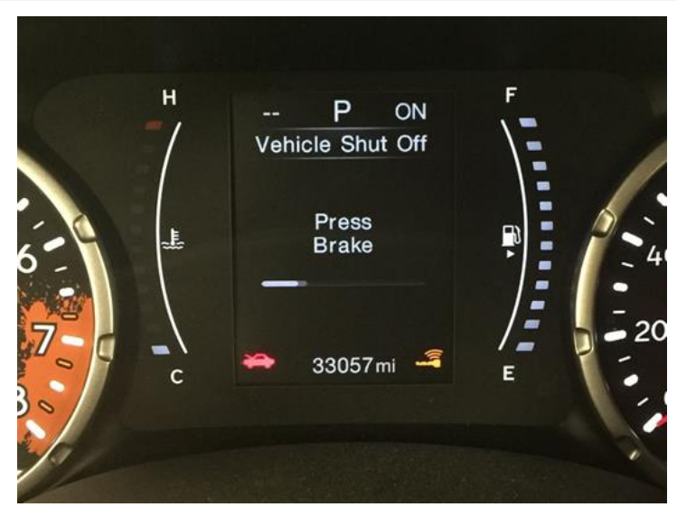
Step 5. First, press and hold the brake pedal AND THEN press and hold the OK button. The Press Brake timer will start.