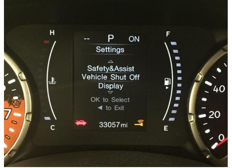
Step 2: Navigate and select "Saftey&Assist Vehicle Shut Off"

This document does not authorize warranty repairs. This communication documents a record of past experiences. STAR Online does not provide any conclusions about what is wrong with the vehicle. Rather, it captures all previous cases known that appear to be similar or related to the vehicle symptom / condition. You are the expert, and you are responsible for deciding on the appropriate course of action.