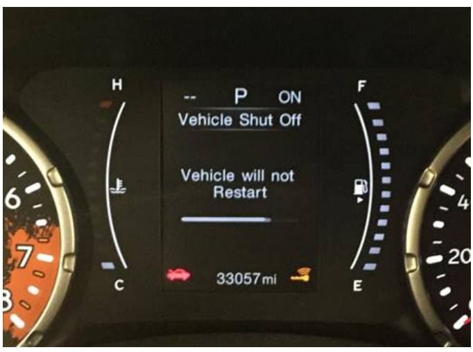
Step 3: The warning message that the vehicle will not restart is displayed. Press and HOLD the EVIC OK button. A timer bar will appear.