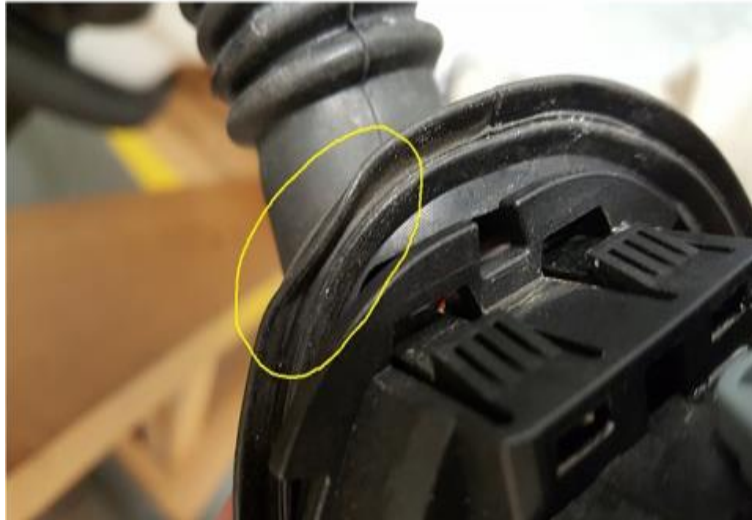
Fig 3, Inspect the grommet sealing surround and align as needed.

This document does not authorize warranty repairs. This communication documents a record of past experiences. STAR Online does not provide any conclusions about what is wrong with the vehicle. Rather, it captures all previous cases known that appear to be similar or related to the vehicle symptom / condition. You are the expert, and you are responsible for deciding on the appropriate course of action.