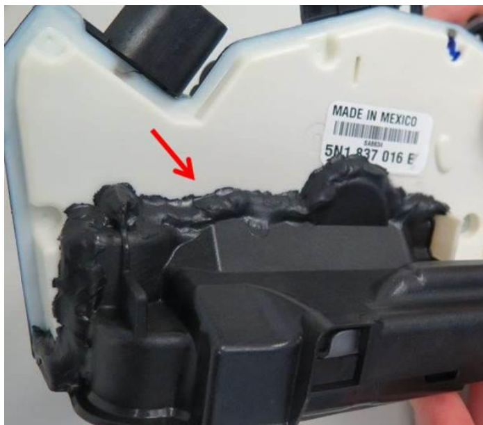
Figure 6: (Example: butyl sealing cord pressed down/spread out by hand).