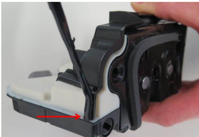
Figure 3: Starting position for routing Butyl sealing cord.