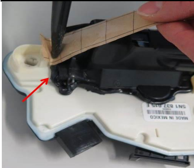
Figure 5: pressing down Butyl sealing cord with suitable tool.