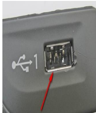
Figure 1. Pin damage.