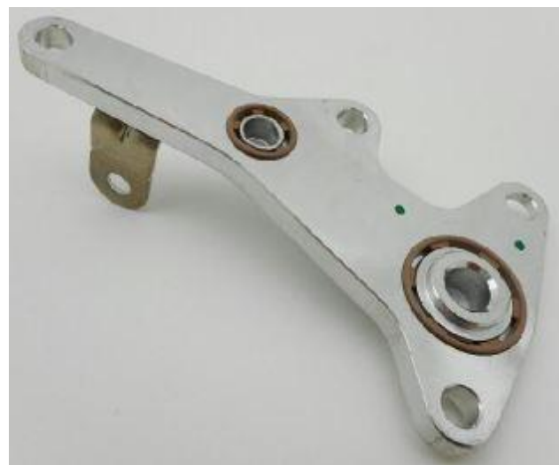
Figure 2. ATF cooler adaptor example.