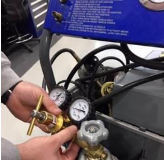
Figure 2. Installing NITROKITG manifold set.