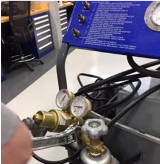
Figure1. Removing the KLI9210DLX manifold.

Before setting up the NITROKITG on the vehicle, check for pressure in the refrigerant circuit. If there is refrigerant in the system evacuate the refrigerant circuit using an approved R134a/R1234yf refrigerant station.