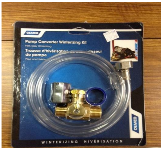
Airstream Part Number 100363W

I am attaching a picture of the Pump Converter Winterizing Kit (T- Kit) to winterize the lines with antifreeze and a picture of the blow out plug needed for winterizing with compressed air.