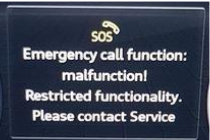
Figure 1. Emergency call malfunction warning.

• An SOS Warning is displayed in the instrument cluster (Figure 1).