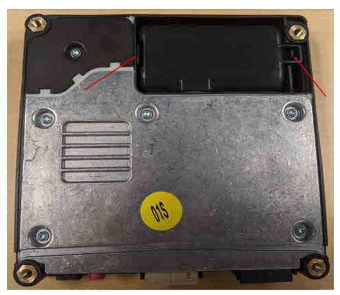
Figure 2. Backup battery compartment location.