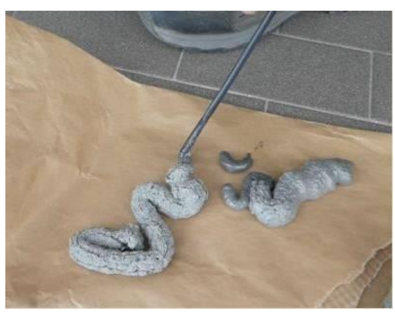
Figure 7. Purging air from the nozzle in preparation of the cavity fill.

Remember to hold the can vertically with the nozzle pointing down. When the trigger is fully pulled, about 0.25 liters of foam is ejected per second. The foam will expand up to 100%.