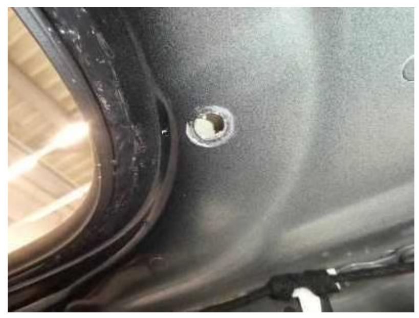
Figure 5. Hole drilled.

2K insert foam D 506 KD1 A3 – or- D 506 KD1 A4 will be needed for the rework procedure. Shake the can for two full minutes plus an additional 20 shakes to ensure a homogenized mixture (Figure 6).