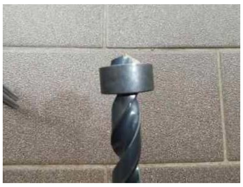
Figure 3. 10 mm drill bit with a depth stop installed.

There are a number of methods for limiting the drill depth. Among them is the use of a drill bit depth stop (Figure 3).