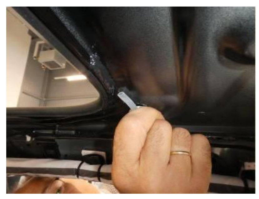
Figure 9. Hose insertion simulation in the 'B' direction.

9. Figure 9 illustrates the hose as it will be inserted in the 'B' direction.