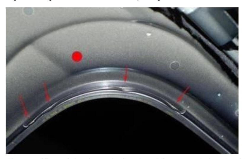
Figure 2. The red dot shows the location of the 10 mm hole to be drilled.

A 10 mm diameter hole is to be drilled in the spot marked with the red dot shown in Figure 2.