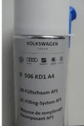
Figure 6. Foam to be used in the rework procedure.