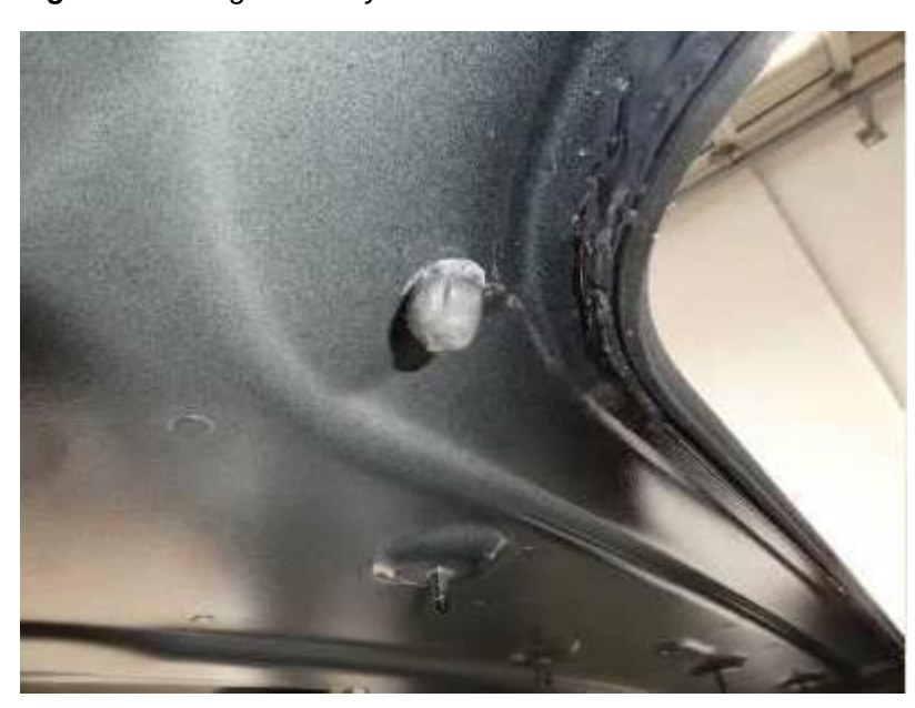
Figure 12. A filled cavity.

12. Cavity filled with the correct volume of foam (Figure 12). Allow the foam to cure for 12 hours.