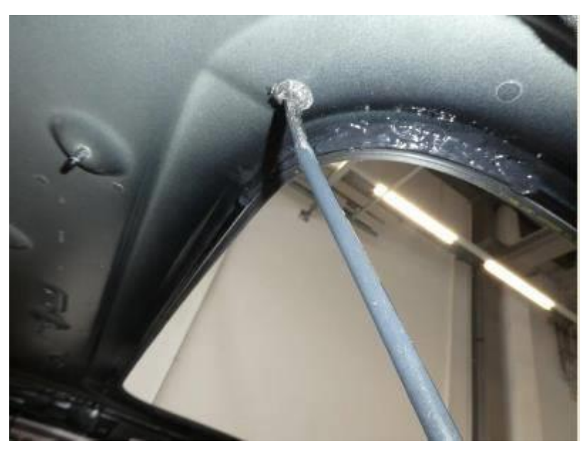
Figure 11. Filling the cavity with foam.

12. Cavity filled with the correct volume of foam (Figure 12). Allow the foam to cure for 12 hours.