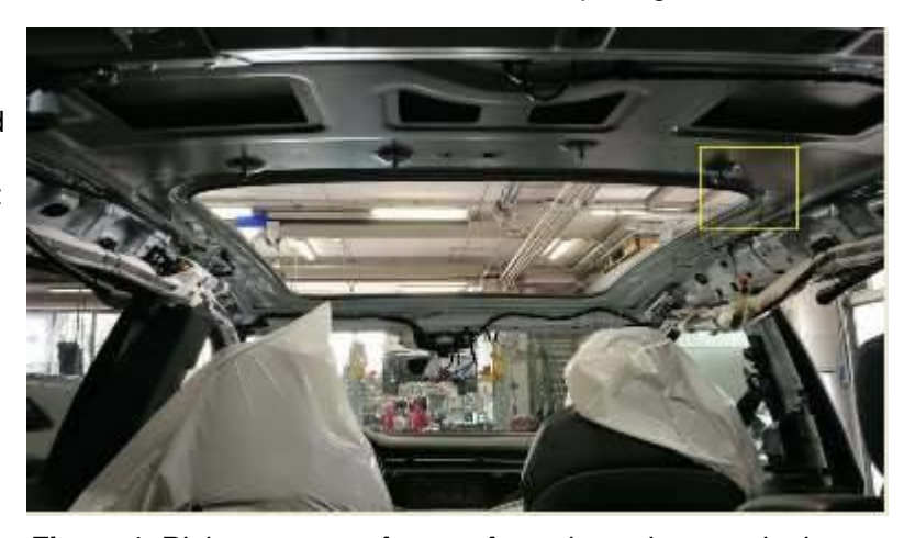
Figure 1. Right rear area of sunroof opening to be reworked.

Remove the headliner and sliding sunroof assembly. Figure 1 shows the area to be reworked in the rear of the sunroof opening, beginning with the right rear.