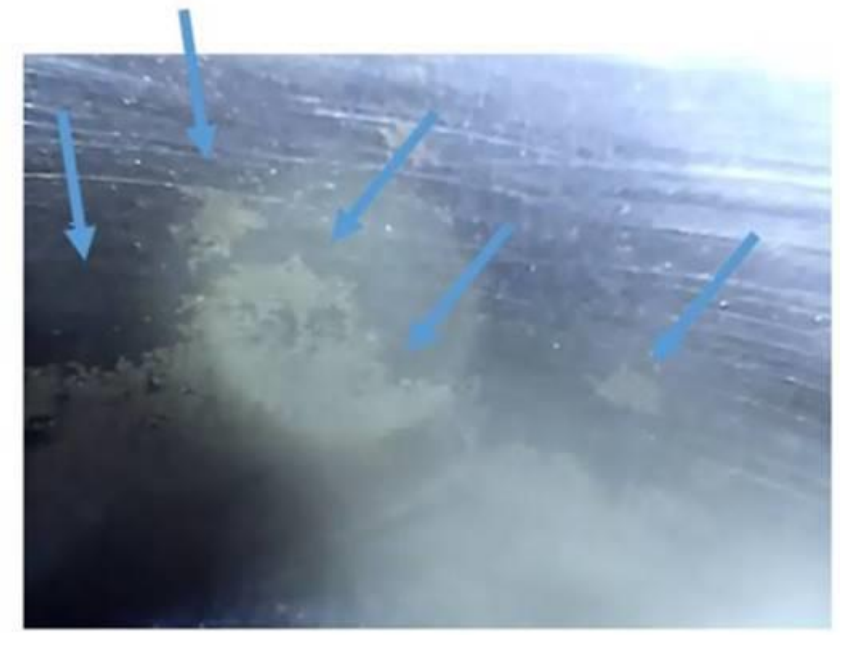
Figure 2. Corrosion marks on cylinder walls (close-up).