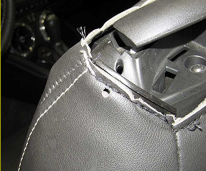
4. Using a 4.0 mm hole punch, punch a hole through BOTH the cover material and the plastic retainer (1).