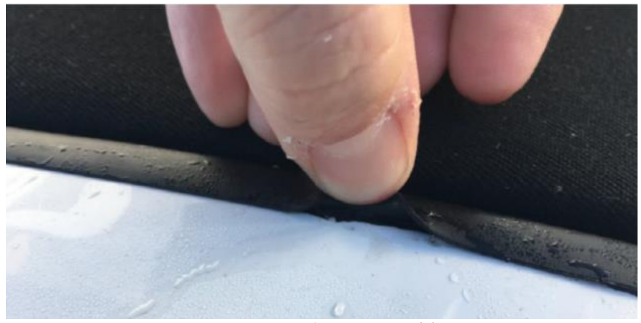
Fig 3 inspect for butyl void(s).