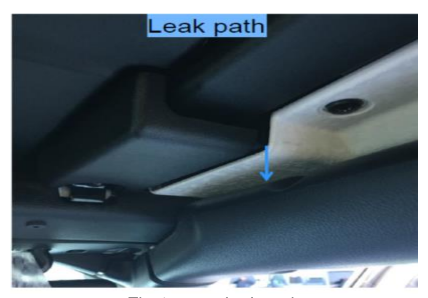
Fig 1 water leak path

Discussion: A leak coming from the far corners (front or rear) of a Sky Slider could be the result of water leaking under the side seals. The side seals are sealed to the body with butyl. If the butyl is not "bedded" or sticking to both the seal and the body or if there is a skip/void in the butyl water could go under the seal and come in to the Jeep.