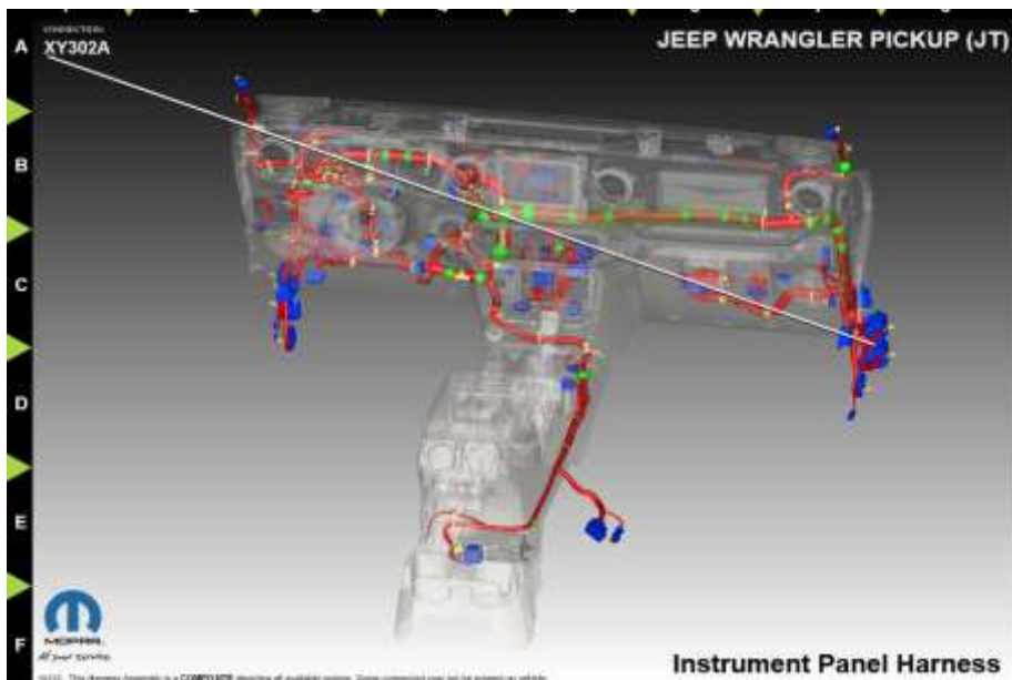
XY302A – 34 way Grey connector