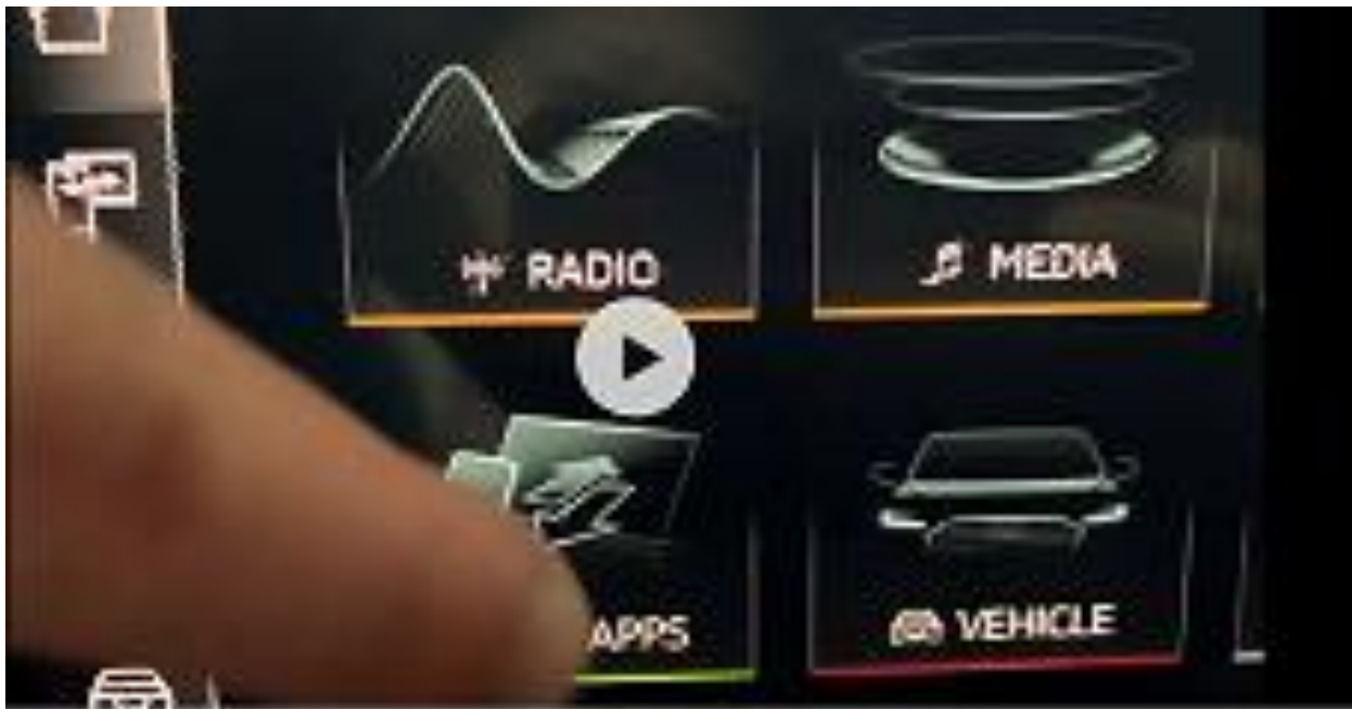
Figure 1. The MMI screen is fuzzy.