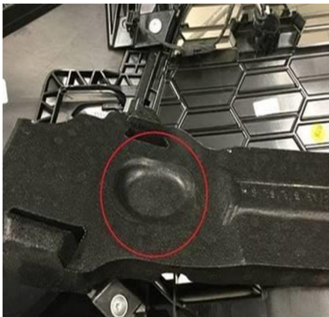
Figure 2. Opening in front bumper foam insert no longer present.