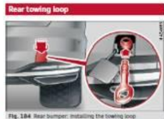
Fig. 184 Rear bumper: installing the towing loop