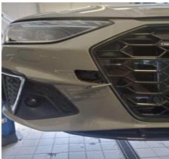
Figure 1. Cover for threaded opening for front towing loop removed.