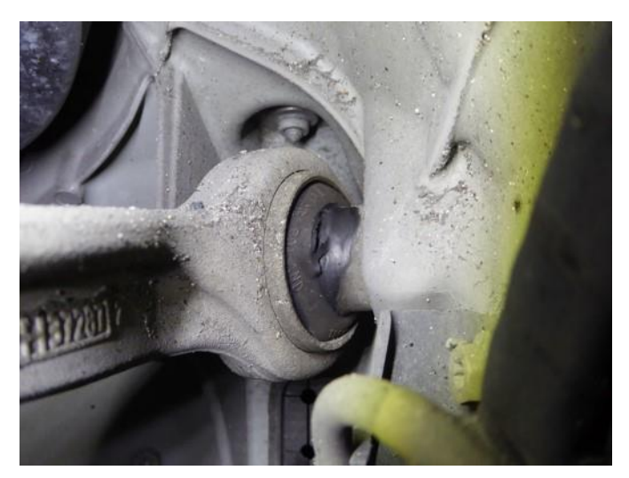
Figure 1. Damage to the rubber mounting.