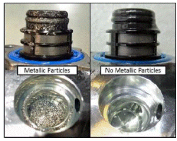
Figure 2. N290 fuel metering valve and valve bore shown with and without metallic particles.

2. Remove the N290 fuel metering valve, and inspect both the valve and valve bore for metallic particles (Figure 2).