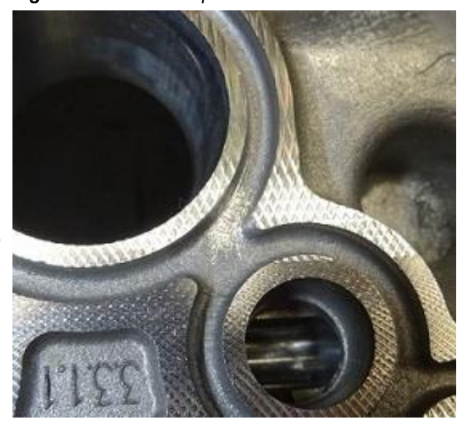
Figure 6. After the repair.

8. Install a new seal, re-assemble camshaft cover, clean the engine compartment, and if necessary replace the noise insulation (if it is full of oil).