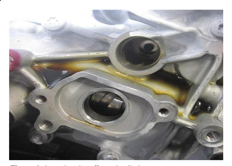
Figure 3. Locating the affected cylinder.