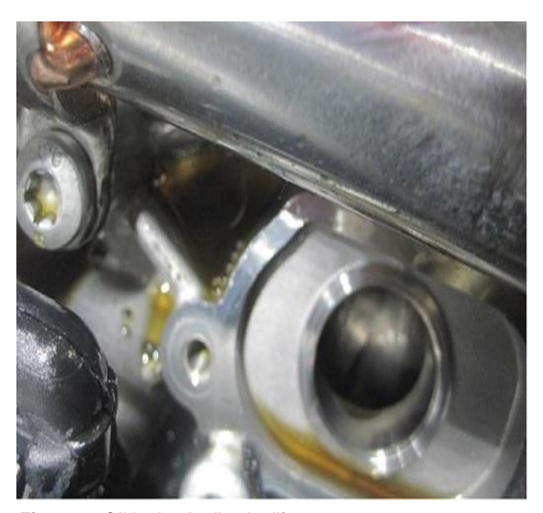
Figure 2. Oil in the Audi valvelift system.

B. If there is no substantial quantity of oil below the Audi valvelift system actuator continue with Step 4!