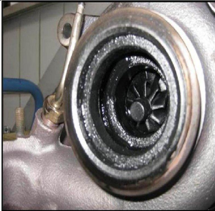
Figure 1 (broken turbocharger shaft, engine oil ingress on exhaust side).