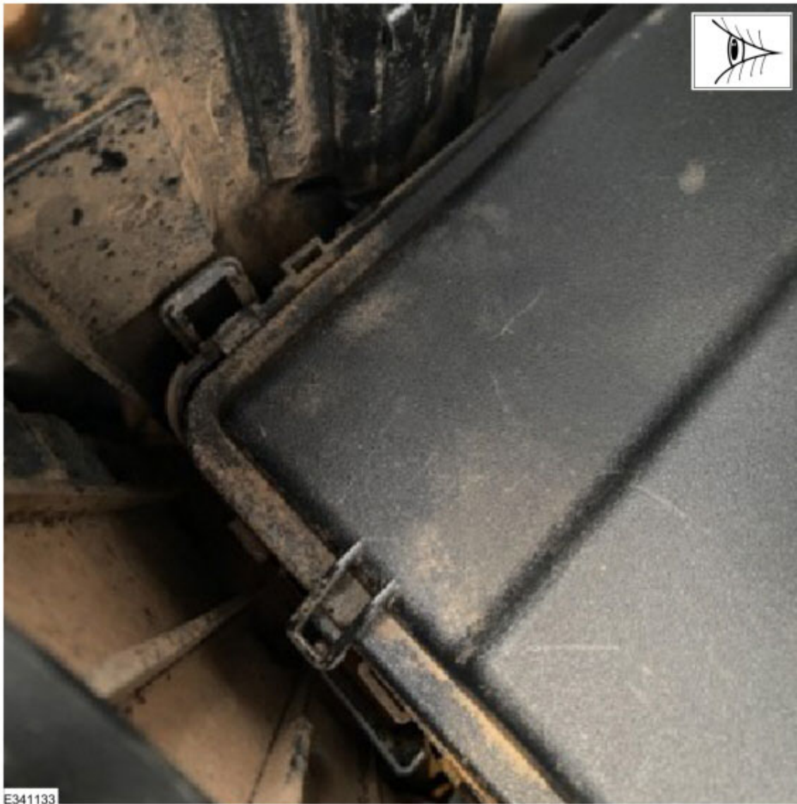
Figure 2 - Example of moisture intrusion with BJB cover off