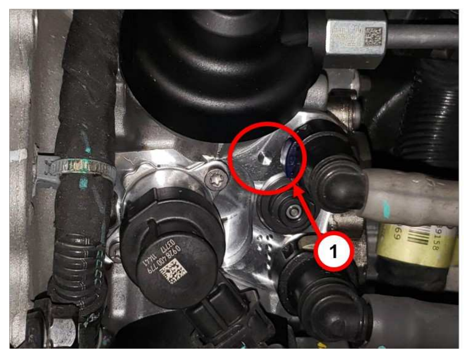
Fig. 1 New Style Symmetrical Cam Design Pump