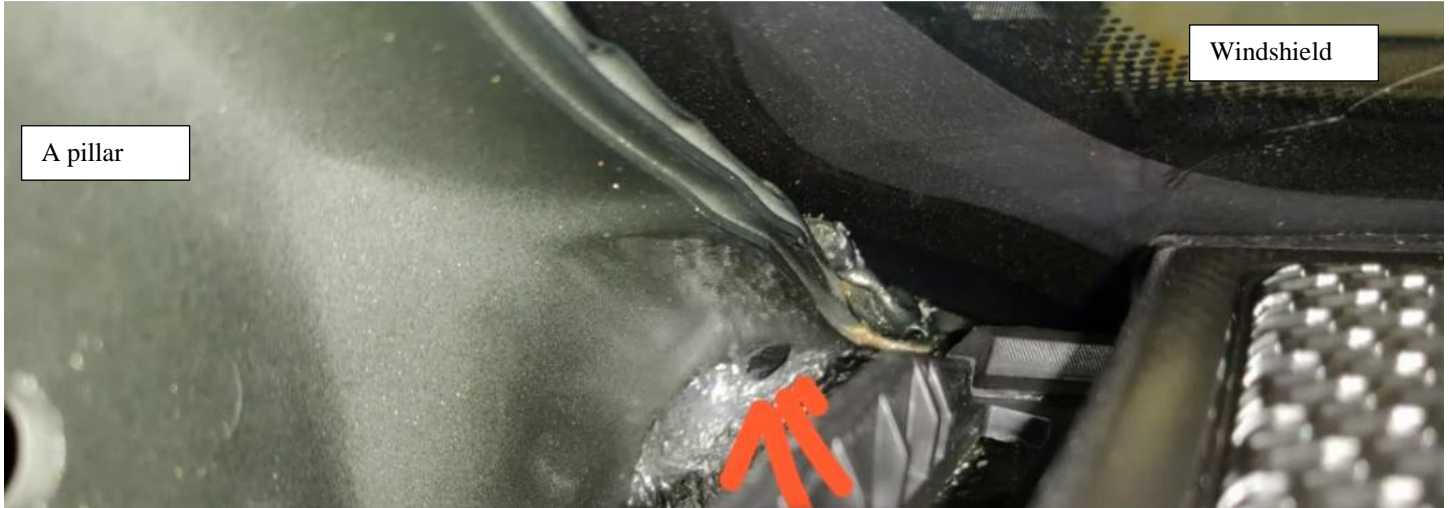
Example of a void in sealer viewed with A Pillar trim removed

This document does not authorize warranty repairs. This communication documents a record of past experiences. STAR Online does not provide any conclusions about what is wrong with the vehicle. Rather, it captures all previous cases known that appear to be similar or related to the vehicle symptom / condition. You are the expert, and you are responsible for deciding on the appropriate course of action.