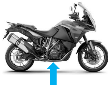
Fig. 1 – Motorcycle side view

The torque of these two screw plugs needs to be checked in order to prevent any leaks. Dealers must perform the torque check on all affected motorcycles in their inventory prior to any customer delivery. Please contact all of your customers who own affected motorcycles to have the screw plugs checked soon as possible.