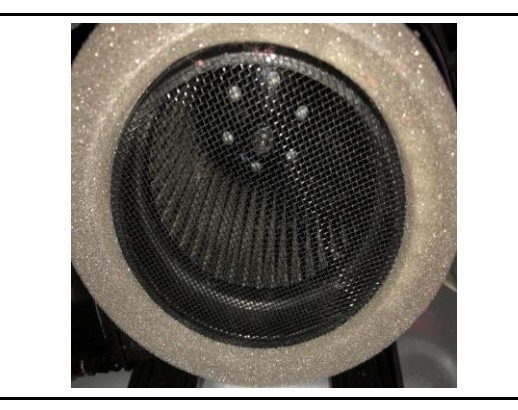
Figure 5. Example of a Dirty RAV4 HV Battery Cooling Intake Filter

Figure 4. Example of a Clean Prius C HV Battery Cooling Filter