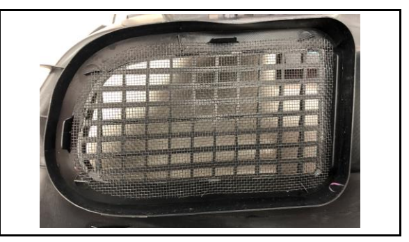
Figure 6. Example of a Clean RAV4 HV Battery Cooling Intake Filter