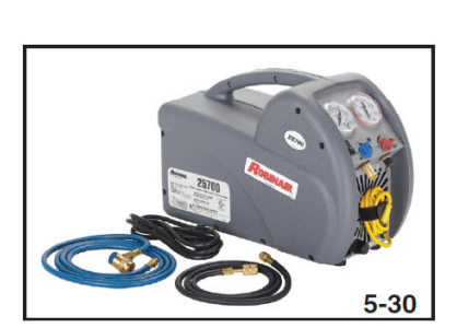
Contaminated Refrigerant Recovery Machine