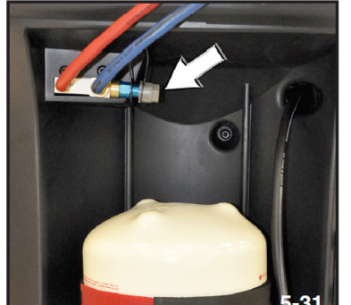
Contaminated Refrigerant Recovery Machine Connection Port