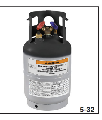
Contaminated Refrigerant Recovery Tank