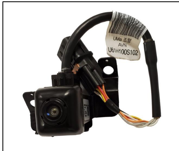
Back View Camera Assembly

This bulletin provides the procedure to replace the rear view camera on some 2016-2020MY Sorento (UMa) produced from SOP through July 9, 2020, due to distortion and/or blue screen caused by moisture intrusion into the camera assembly. The replacement camera part numbers listed in the part table have been improved to more effectively seal the camera to prevent moisture ingress in the camera assembly and improve the customer concern. Follow the procedure in this bulletin to repair the vehicle.