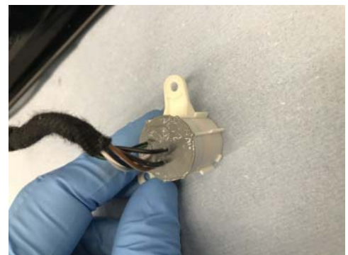
Outer plug contact

Leave the sealant to dry for at least 1 hour before starting assembly.