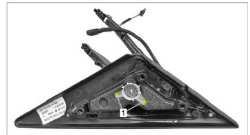
Screws on mirror support

Work Procedure: 1 Loosen and remove screws on the electric plug contact ⇒ Screws on mirror support -1- on the mirror support.