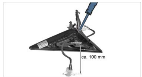
Wire harness for mirror support