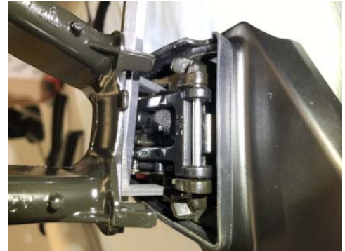
Wire harness routing for mirror support