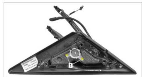
Screws on mirror support