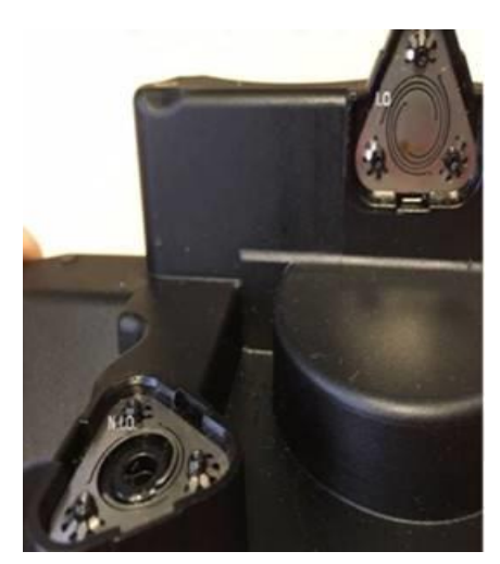
Figure 1. Metal plates.