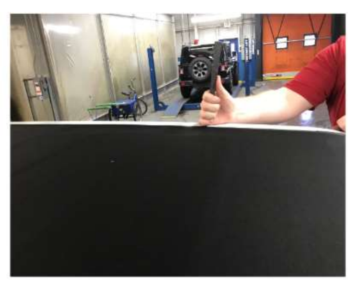
Fig 2 applying pressure to wet out (bed) the butyl.

2. Roll the edge of the seal carefully up and inspect for voids in the butyl (fig 3). If any gaps are found, insert a small rope of butyl under the seal. Wet out (bed) the butyl using process in step 1.