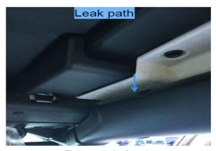
Fig 1 water leak path

Discussion: A leak coming from the far corners (front or rear) of a Sky Slider could be the result of water leaking under the side seals. The side seals are sealed to the body with butyl. If the butyl is not "bedded" or sticking to both the seal and the body or if there is a skip/void in the butyl water could go under the seal and come in to the Jeep.