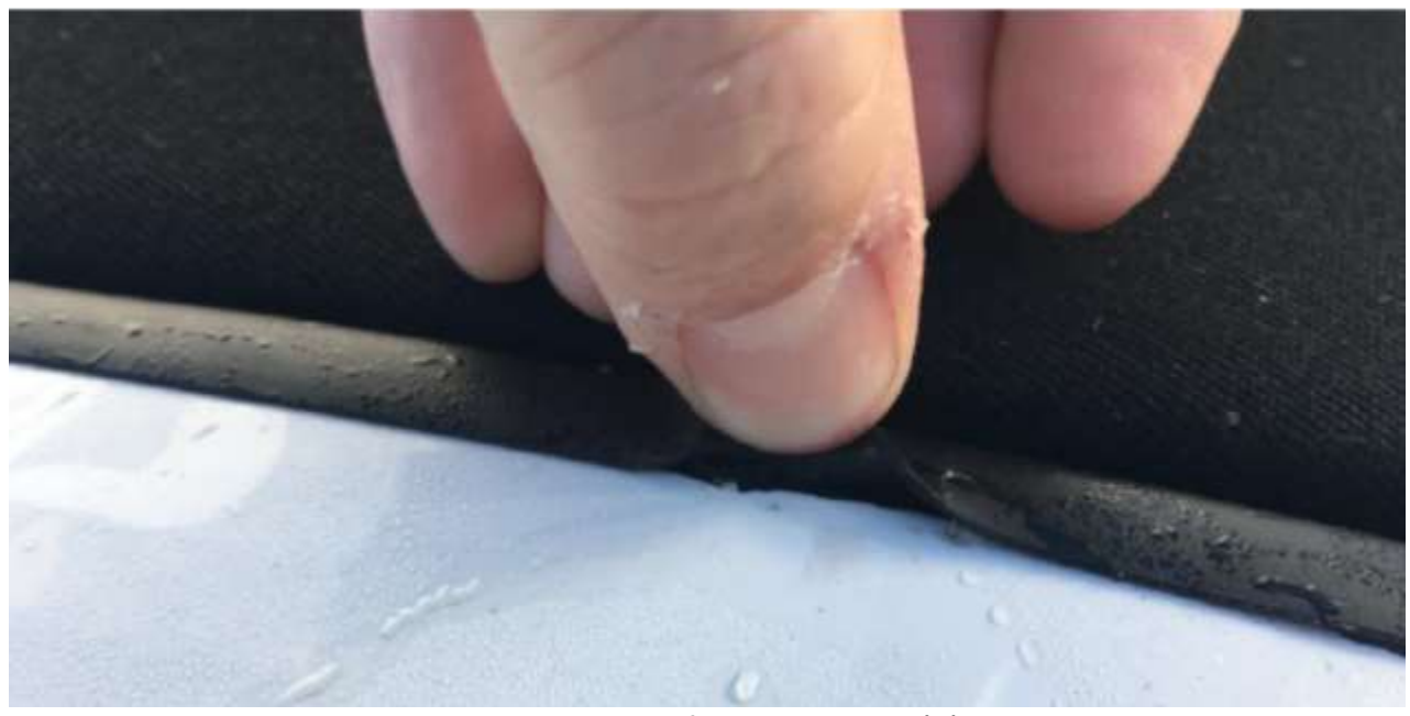
Fig 3 inspect for butyl void(s).