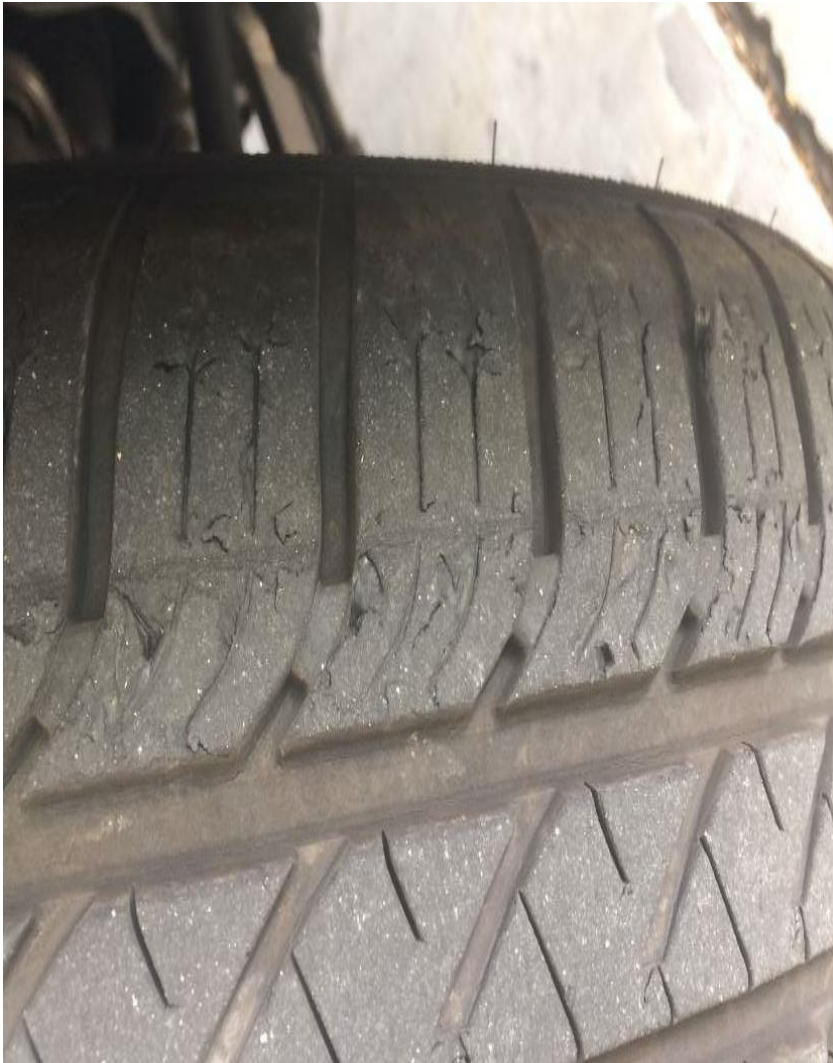
Figure 2. Normal condition.