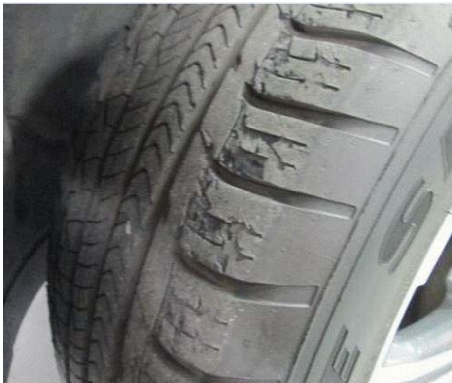
Figure 1. Irregularity on the outer side and on the inner side of the tire.

The following photograph shows a normal condition and the tire cannot be replaced (Figure 2).