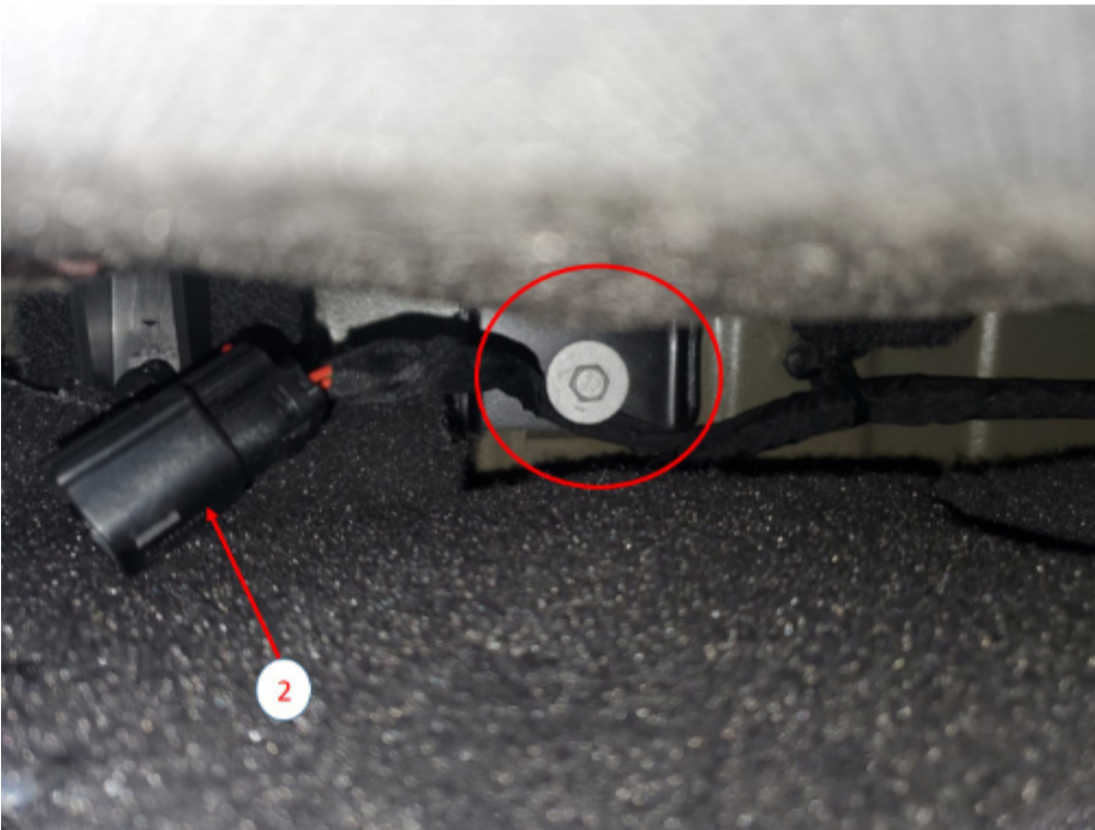
2. Inspect connector X225 for terminal issues/corrosion (3), as shown below. In this scenario, the LIN Bus circuit 4115 was corroded and shorting to other terminals in the connector.