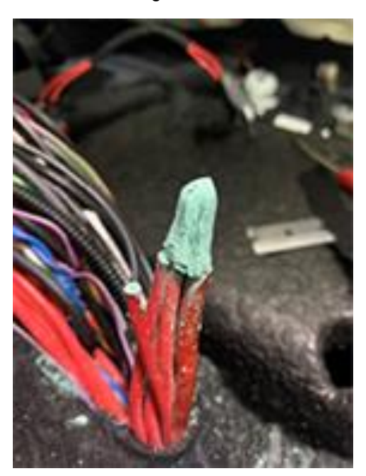
Figure 2. Close up of the wire color and damage.